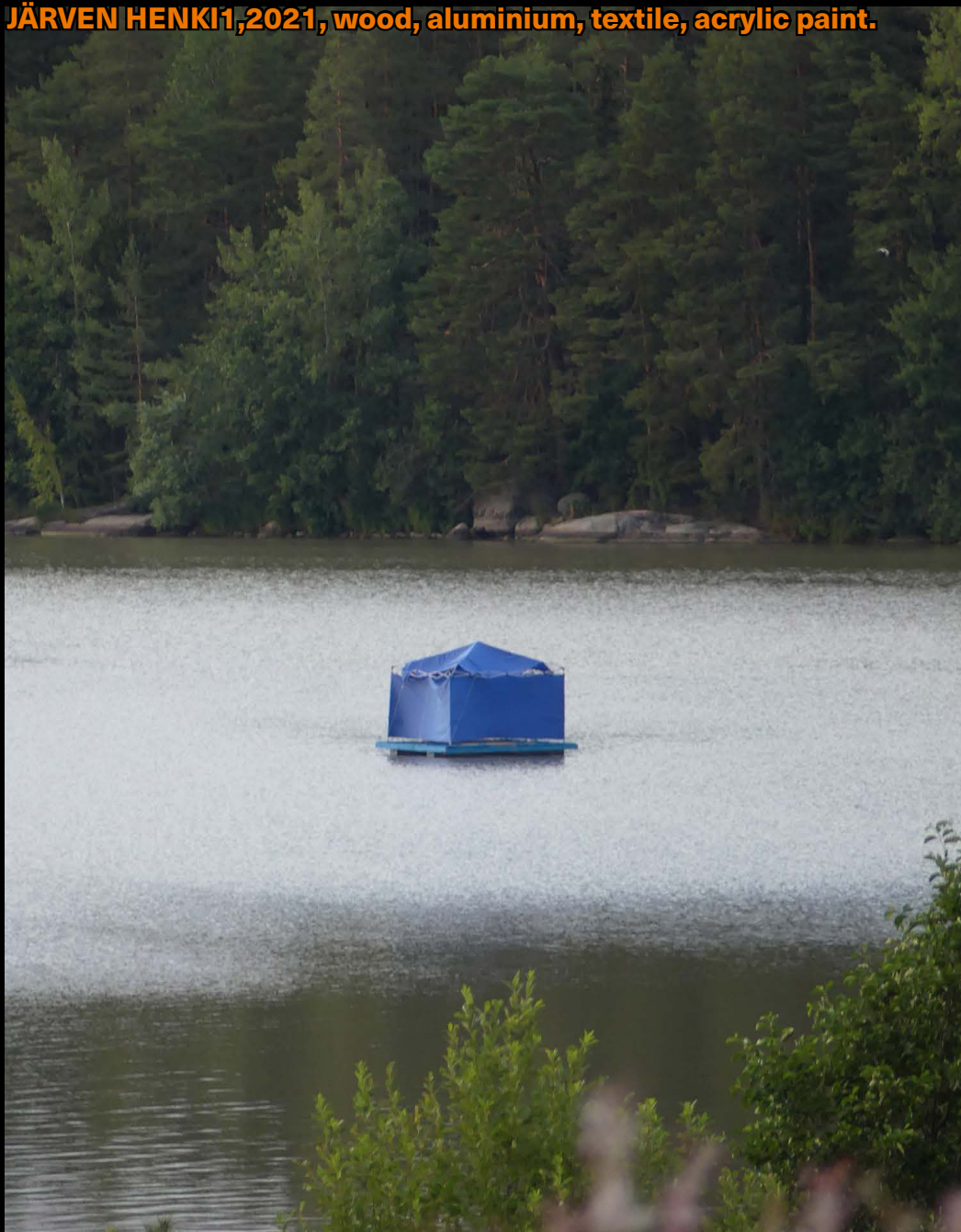
JÄRVEN HENKI1,2021, wood, aluminium, textile, acrylic paint.