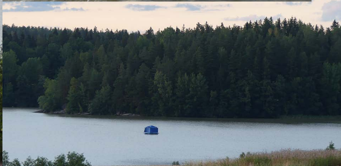
Järven Henki1, 2021, kelluva installaatio Mallusjärvellä. Puu, alumiini, puuvillakangas, maali. 3.2m x 3.2m x 2m