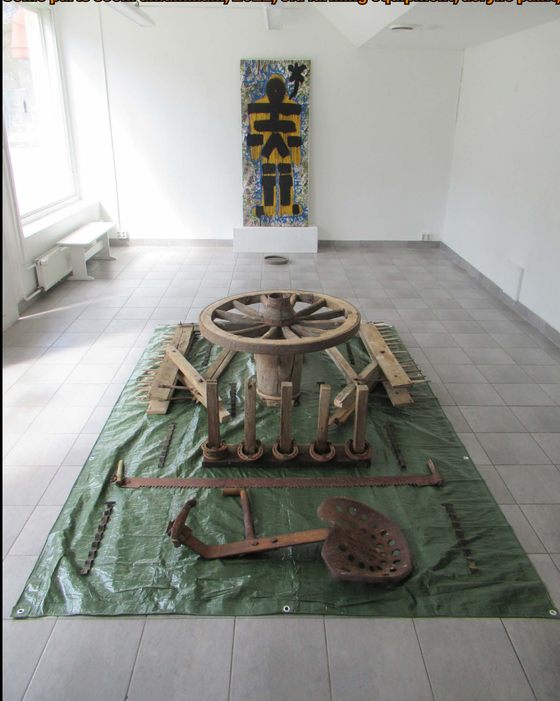
Some parts seem unfamiliar., 2022, old farming equipment, acrylic paint, tar.