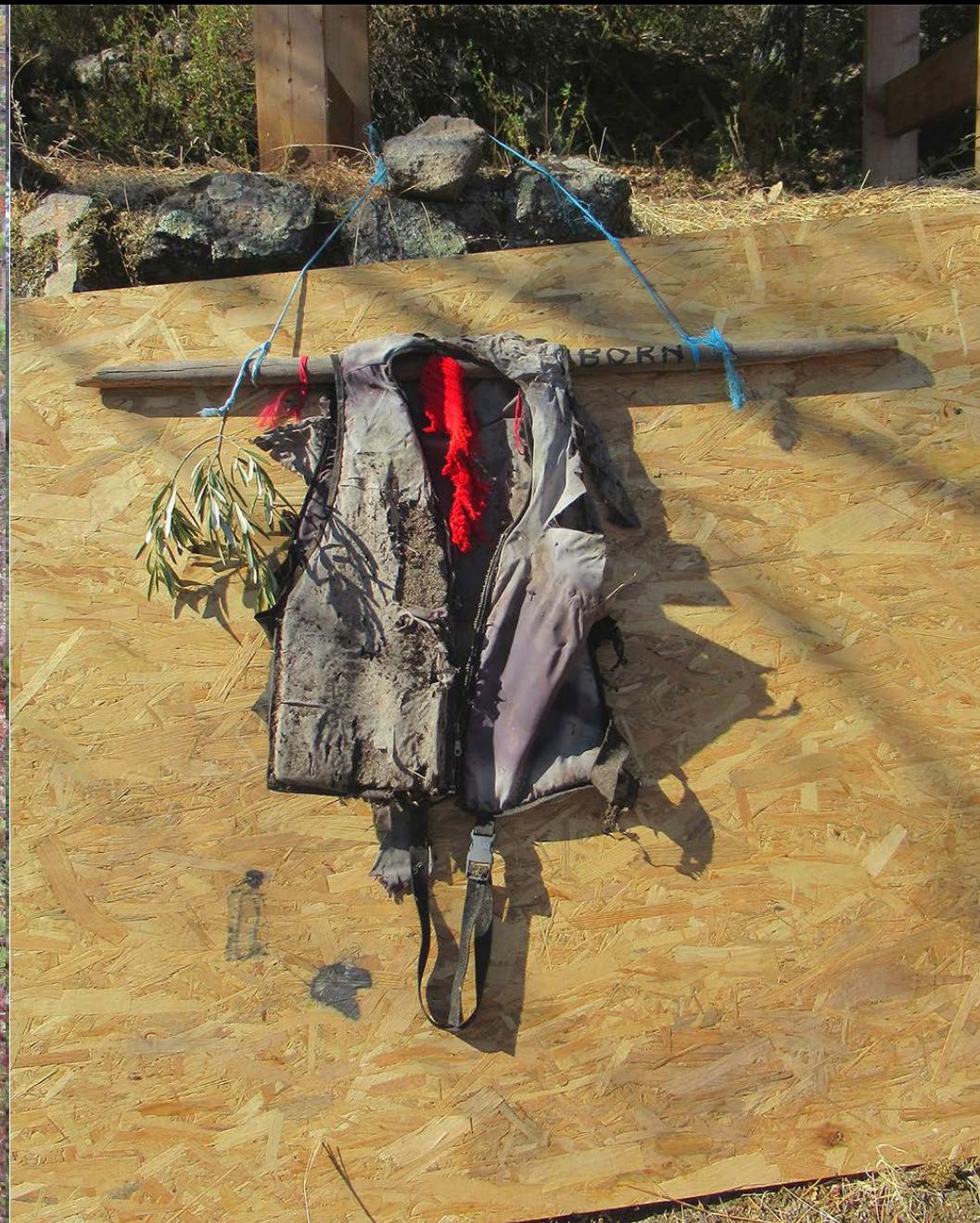
M.A.R.P.S ( Mobile art and research production system ) nro.9, teos rakennettu ymparistosta löydetyistä materiaalesita. Pelastusliivi, paimensauva, oliivipuun oksa, punainen kangas.

66°54'32.3"N 25°21'08.9"E LAPLAND, FINLAND 2020.