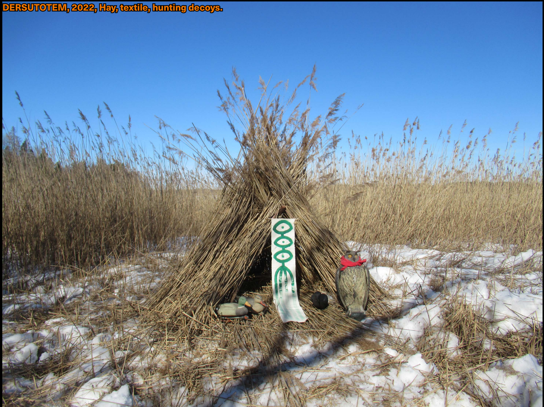
DERSUTOTEM, 2022, Hay, textile, hunting decoys.